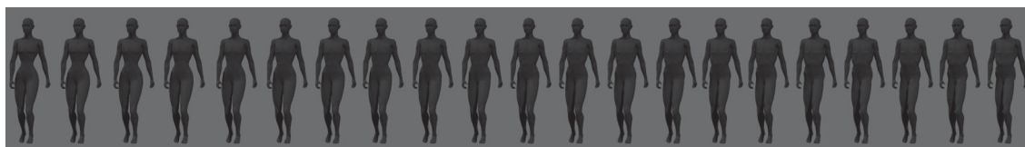
body stimuli varying in waist-to-hip ratio

Figure 1 Stimuli used in studies 1, 2 and 4. Waist-to-hip ratio (WHR) increased in increments of two one-hundredths of a unit from an 'hourglass' WHR = 0.50 to a more 'tubular' WHR = 0.90.